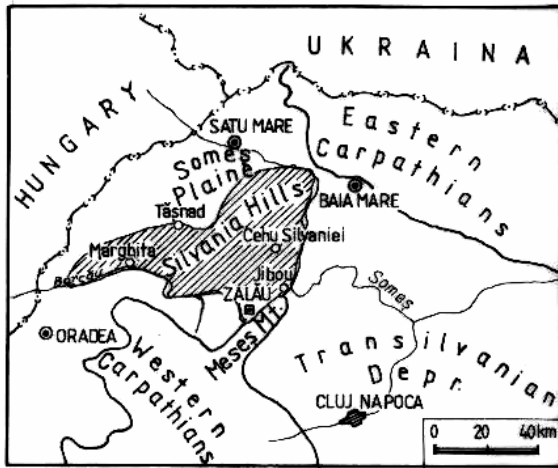
Fig. 3 Sylvania hills geographical position in the North-West of Romania

has not been completed yet. However, we can highlight the existence of several components of a system and of several subsystems, which can be integrated into larger settlement systems polarized by county capitals and with territories in the Sylvania Hills. This calls for the identification of four general settlement systems that have as centres Zalău, Oradea, Satu Mare and Baia Mare. The polarizing tendency is both administrative and economic, due to the influence of the industry and the service diversity offered (Fig. 3).